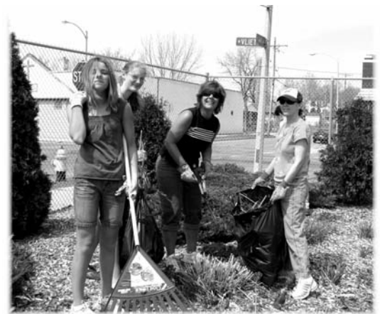
Workcampers at Garden Clean-up Day at Repairers of the Breach.

Several of our recently confirmed 11th grade students identify Workcamp as a turning point in their spiritual lives. One such student wrote, "We would go in small groups to those in need of basic home repairs, especially those who could not afford the repairs or were not able to perform them themselves. We painted the insides and outsides of houses, built wheelchair ramps, rebuilt stairs, and resealed roofs. Neighbors pitched in, residents would help and, by midway through the week, seemingly the entire town was