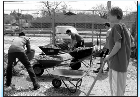
Repairers member and Good Shepherd workers load woodchips to spread round the garden.

And the kids who participated? What was their reflection on the experience? "I thought it was an incredible, eye-opening experience. It made me realize how lucky I am and I was amazed by how those who have so little can have so much hope and faith",