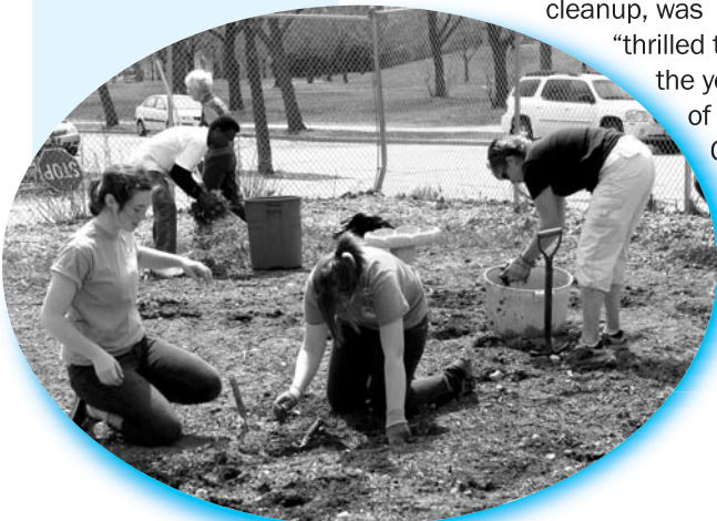
Workers weed the vegetable garden.

The garden cleanup is one of many service projects workcampers can participate in, to help defray expenses. They also have fund raisers, including the Bowl-a-thon, flower sale and pancake breakfast.