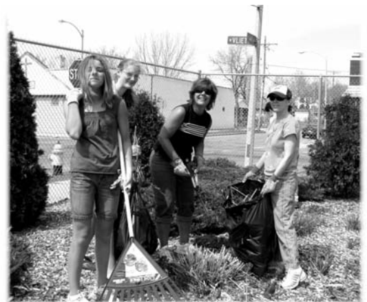
Workcampers at Garden Clean-up Day at Repairers of the Breach.

Several of our recently confirmed 11th grade students identify Workcamp as a turning point in their spiritual lives. One such student wrote, "We would go in small groups to those in need of basic home repairs, especially those who could not afford the repairs or were not able to perform them themselves. We painted the insides and outsides of houses, built wheelchair ramps, rebuilt stairs, and resealed roofs. Neighbors pitched in, residents would help and, by midway through the week, seemingly the entire town was