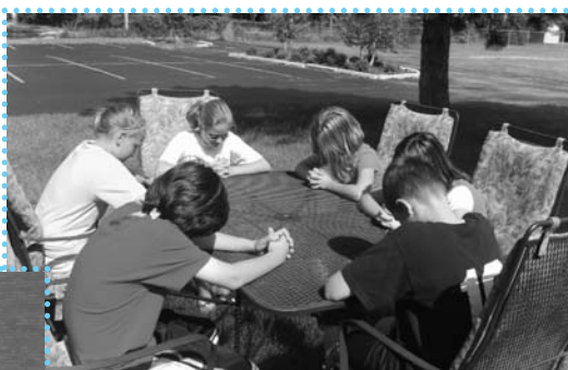
Taking time to pray ...