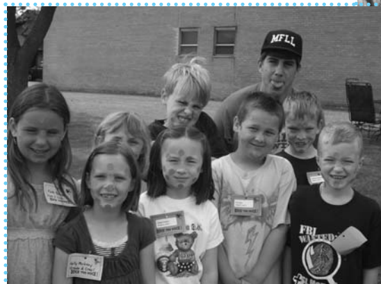
Bugs and boils ...