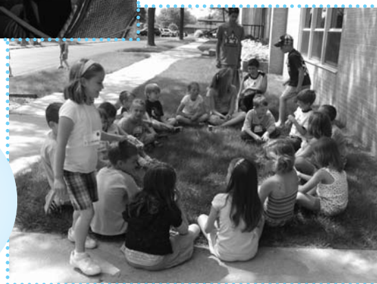
Game time ...